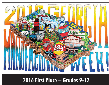
2016 First Place – Grades 9-12