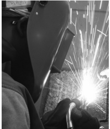
Technical and Industrial