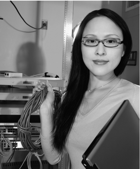
Business and Computers